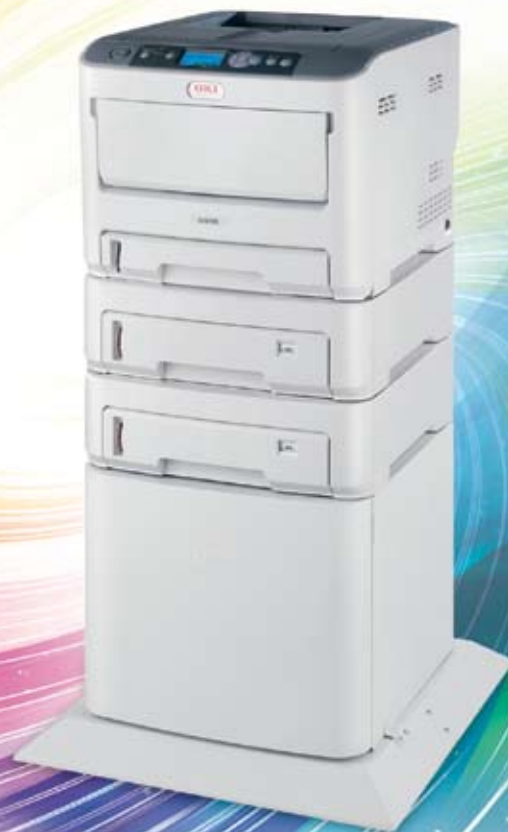
C610dtn with optional 3rd paper tray and cabinet

There are three models to choose from, and the option to expand from a desktop printer to a floor-standing model. With the addition of 2 paper trays and a convenient storage cabinet, the C610 can grow along with your business.